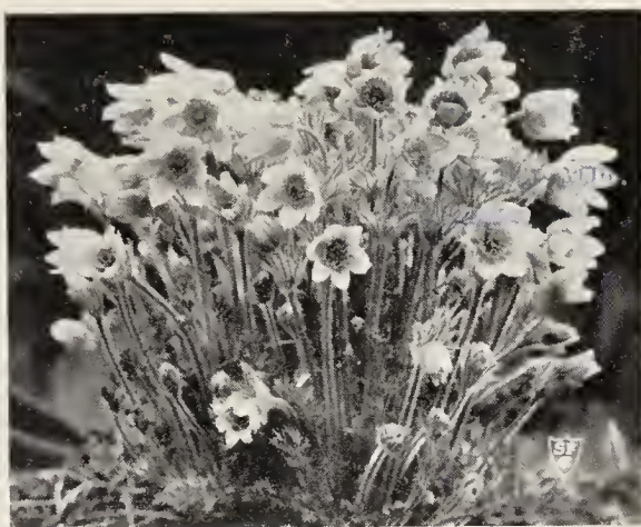
ANEMONE PULSATILLA OR PASQUE FLOWER

One of the Floral Gems in Our Collection